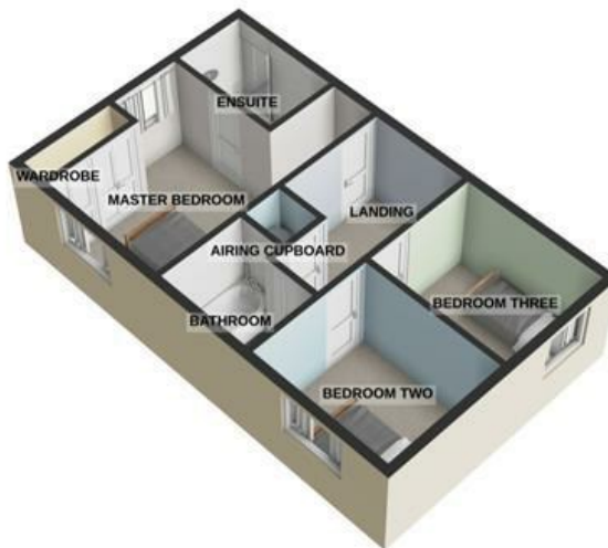
TOTAL FLOOR AREA : 1022 sq.ft. (94.9 sq.m.) approx.

For illustrative purposes only. Decorative finishes, fixtures, fittings and furnishings do not represent the current state of the property. Measurements are approximate. Not to scale. Made with Metropix © 2025